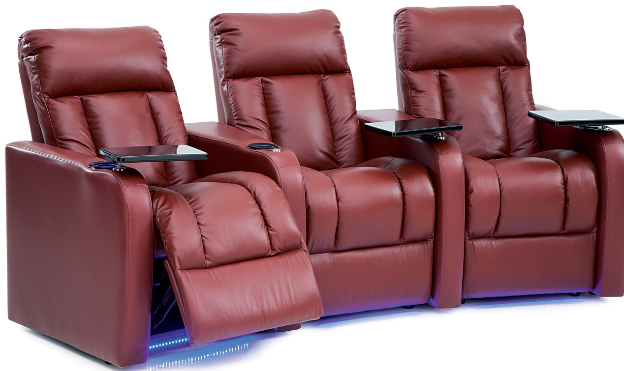
FEATURE IMAGE (shown) CONFIGURATION AK 5E LHF Power Recliner w/ RHF Wedge Arm 7E RHF Wedge Arm Power Recliner 3E RHF Power Recliner